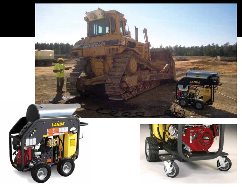
MHC4-35324E/B features a low RPM belt-drive pump.

With a rugged frame, stainless steel top wrap, and 13" flat-free tires, the MHC is both durable and portable, and easy to maneuver over flat surfaces and around corridors and hallways. The control panel is strategically located, allowing you to easily adjust the thermostat and hour meter depending on your needs. A technologically advanced engine-and-regulator combination eliminates the need for a battery or electrical connection, making it a convenient and versatile on-site choice for keeping your restaurant, resort, spa, or hotel clean and inviting!