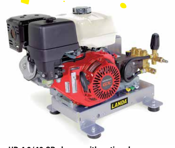
HD 4.0/40 GB shown with optional skid mount feet