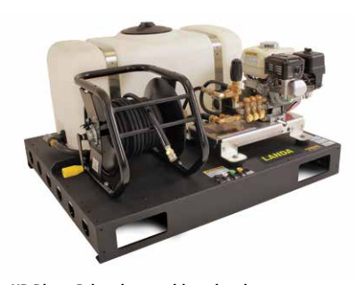
HD Direct Drive shown with optional HD Pallet Skid with Tank