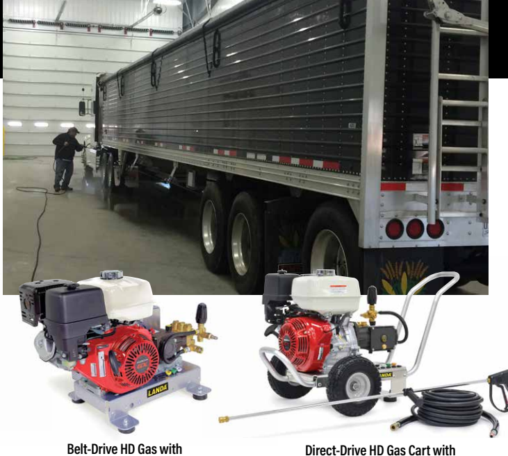
Belt-Drive HD Gas with Direct-Drive HD Gas Cart with optional skid mount feet optional skid mount feet