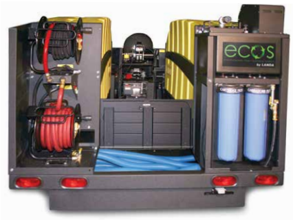
Galley storage compartment underneath the floor allows for easy storage of the vacuum hose. Shown with garden hose (not included).

■ Durable Swing-Away Tongue (rated for 7,500 lbs) connects with either a 2 <sup>5</sup>/16-inch Ball Coupler or Lunette Ring (DX model), 7-pin Electrical Trailer Plug and heavy-duty 2,000 lb. capacity Swivel Jack, allowing trailer to be stored in a smaller area.